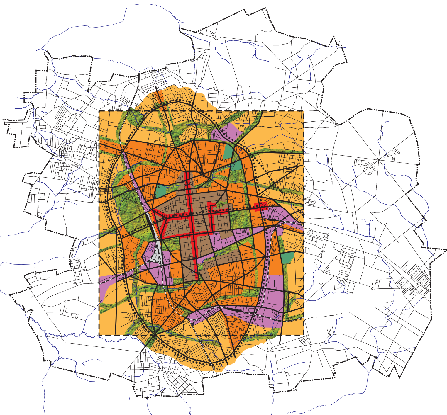
1917 DEVELOPMENT PLAN