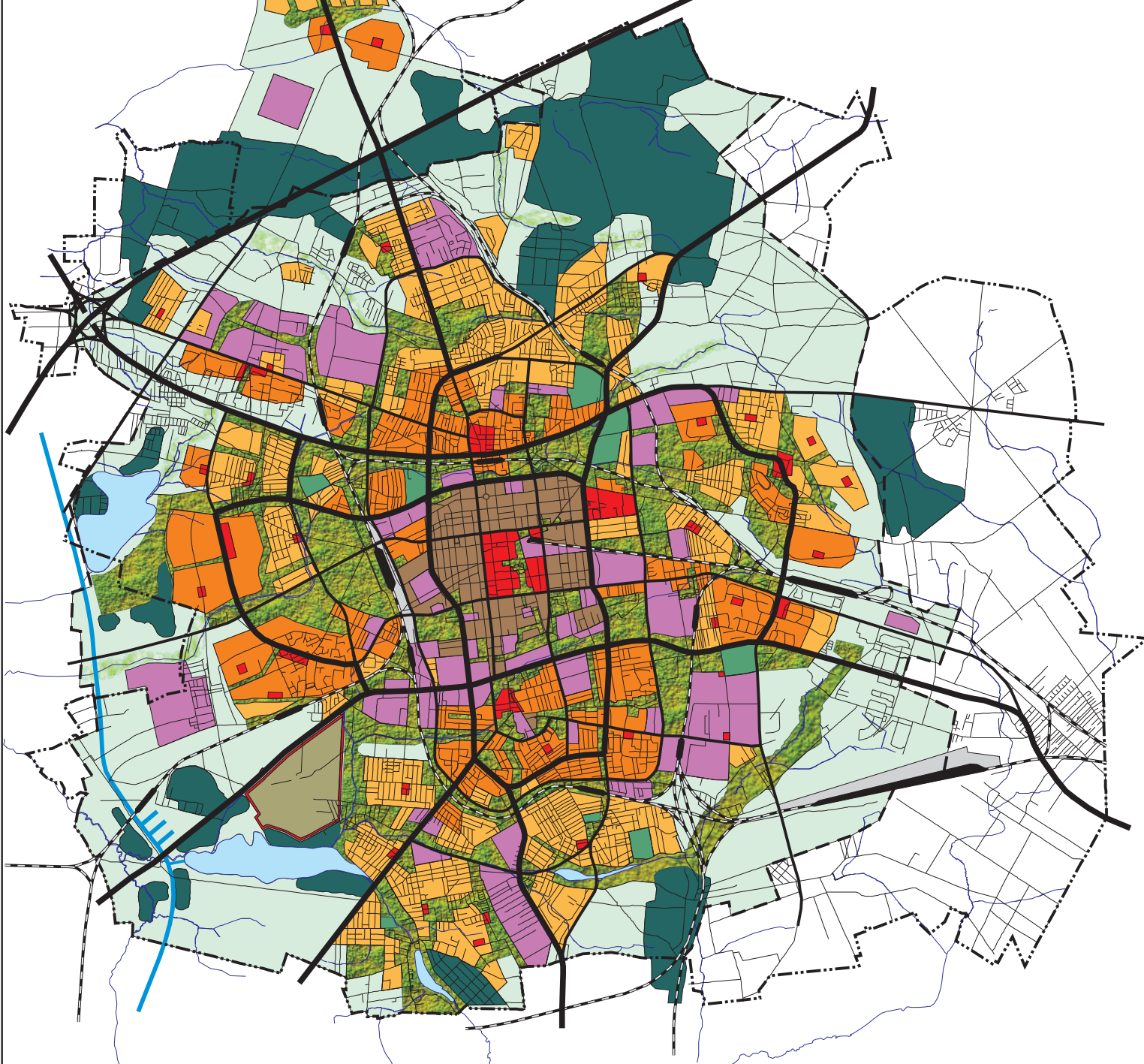
1961 GENERAL DEVELOPMENT PLAN - 1980 DIRECTIONAL PLAN